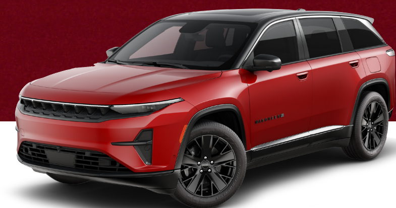
Red Hot Pearl