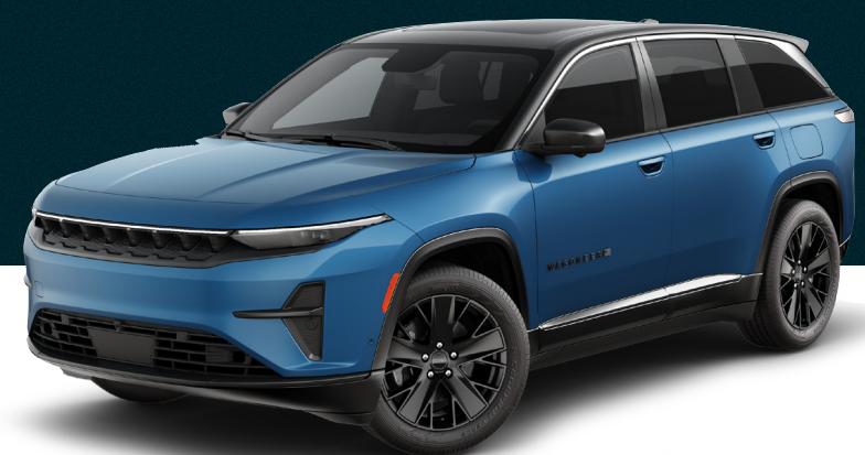
Fathom Blue Pearl