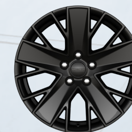
20-inch Gloss Black-Painted Aluminum (Standard)