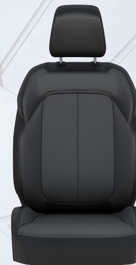
Sicily Leatherette with Axis II Perforations, Blue Agave/Wine Dual Accent Stitching and Rouge Piping — Global Black (Standard)