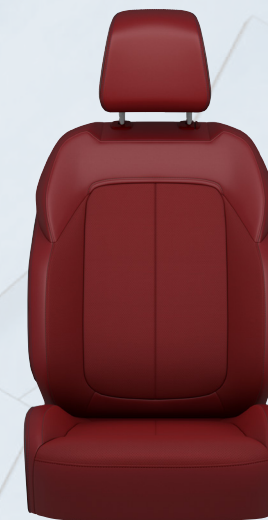
Sicily Leatherette with Axis II Perforations, Blue Agave/Light Slate Gray Dual Accent Stitching and Frost Piping — Black/Radar Red (Available)